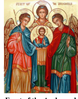
Feast of the Archangels Sept. 29