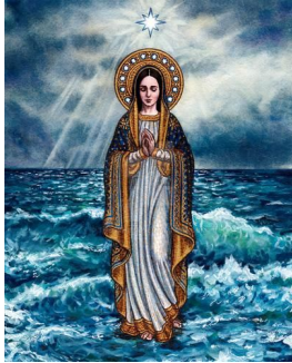
Our Lady Star of the Sea Sept. 27

This week is filled with many beautiful Feast Days!